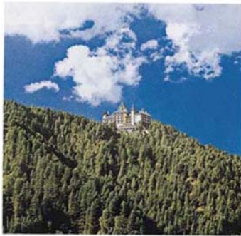
Fashion takes a leaf out of Fall's sensuousness, as the look gets soft, colours merge subtly, and the atmosphere is charged with a touch of wildness. Enter the fairytale, at the Wildflower Hall, Shimla in the Himalayas.