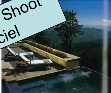
THE ALPINE EXPERIENCE Perched high up in the mountains, the Wildflower Hall, Shimla in the Himalayas-An Oberoi Resort, pampers the senses and offers one of the most breathtaking panoramic vistas. Welcome to Paradise.

Bloc Notes Fashion Photo Shoot by L'Officiel